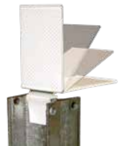
Also available for weak posts