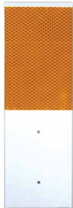
The Fat Cat

The Fat Cat size makes it easy to see in high-speed areas, work zones, dangerous curves and intersections. The larger size also makes it much more visible in low light conditions.