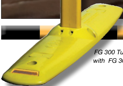
FG 300 Turnpike Curb with FG 300 EFX Post