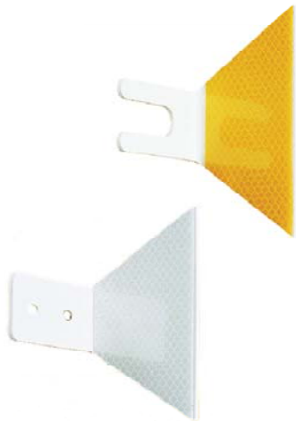
Butterfly Bolt On & Glue On

Butterflies are as bright as molded acrylic markers but won't shatter upon impact, they simply