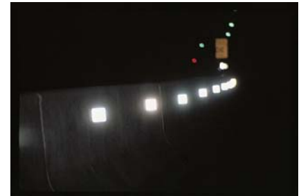
PCBM's at Night

Davidson offers free downloadable CAD drawings and specifications from our website. Contact your local sales representative or email: hwysales@pexco.com for details