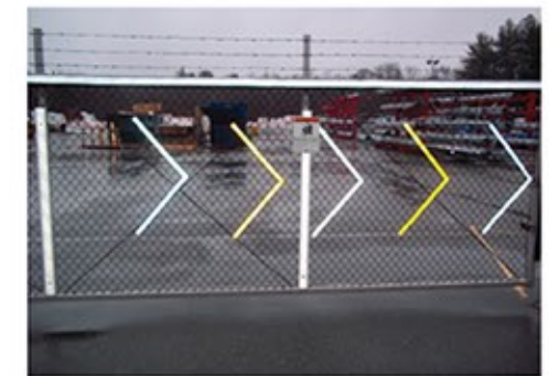
These inserts are so highly reflective, they can be used sparingly and configured as geometric shapes or arrows to gain the desired effect, as in the above chain link gate application.