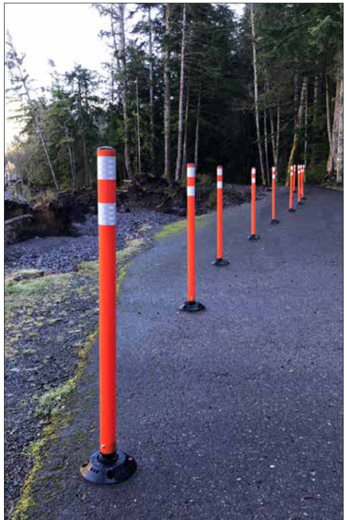
Tubular Surface Mount