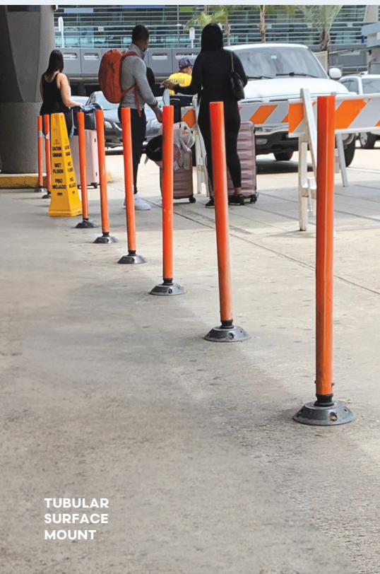
TUBULAR SURFACE MOUNT

FLAT TOP STAR, TUBULAR SURFACE MOUNT AND FLAT TOP GROUND MOUNT DELINEATORS