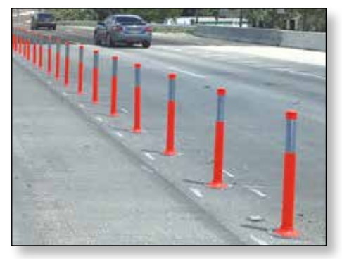
City Post GD Glue Down Veterans Expressway - Tampa FL ADT: 73,000 - Speed: 60 MPH