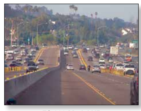
FG 300 Model UR SR 91 Express Lanes - Orange County CA ADT: 300,000 - Speed: 65 MPH

Give us a call to discuss the best post for your project!