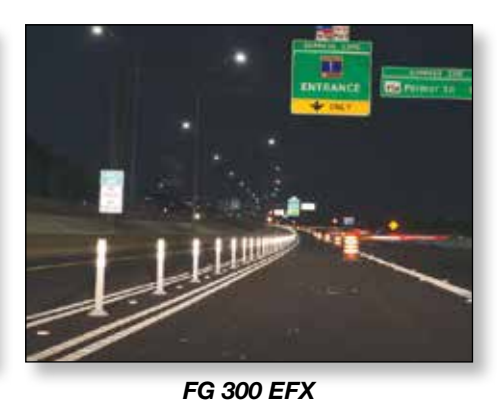
MoPac Express Lanes – Austin TX ADT: 160,000 – Speed: 65 MPH