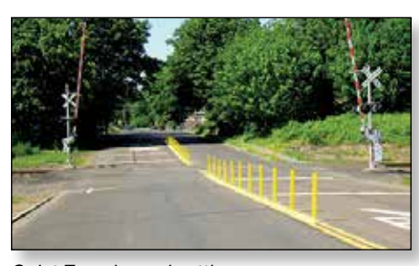
Quiet Zone in rural setting

crossings. The system provides an economical median barrier system for restricting motorists from driving around lowered crossing arms. Median barriers have been shown to decrease accidents and reduce gate violations at at-grade, high speed rail crossings. The FG 300 Curb System is designed to provide a much more effective visual, psychological and physical barrier than other separation systems. When with a post every 3 feet, the FG 300 creates a "picket fence" effect that provides guidance to drivers of proper lane location. impact the curb in an accident.