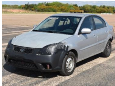
MASH-standard test vehicle.

Seven products from four different manufacturers were tested in the study at College Station, Texas. The results were summarized in Task Report 4, which included the researcher's recommendation to Florida DOT for a minimum performance standard. Actual test results are shown in the following graph (see page 2).