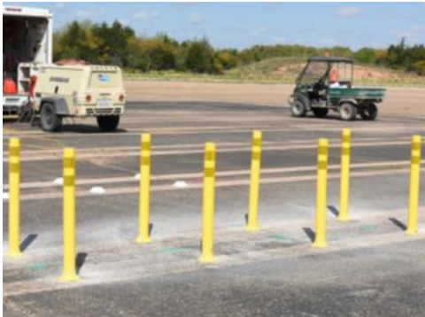
Array of eight posts in two rows of four.