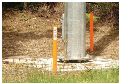
FG 500 Utility Marker