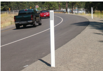
FG 400 Roadside Delineator Post