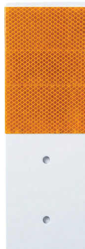
The Fat Cat