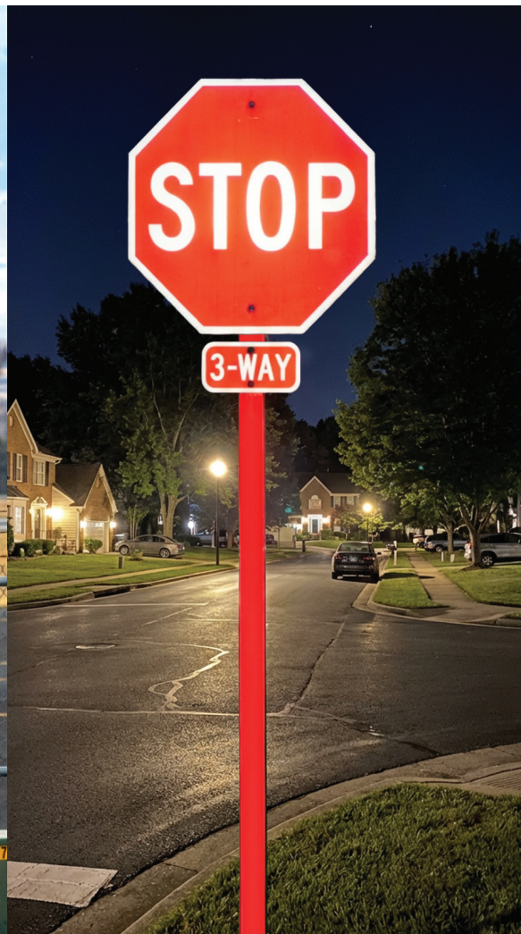
Reflector at Night