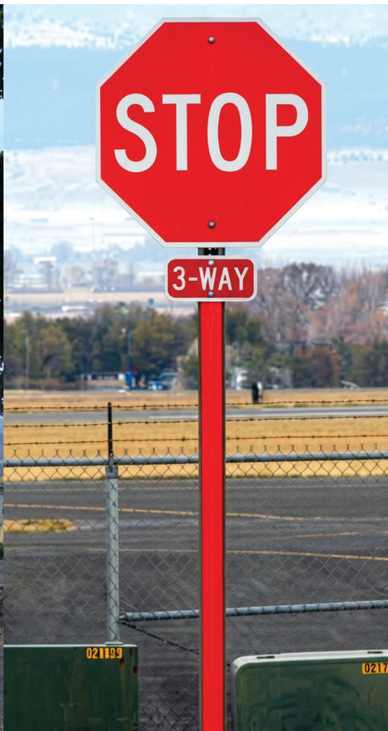
Reflector in Daylight