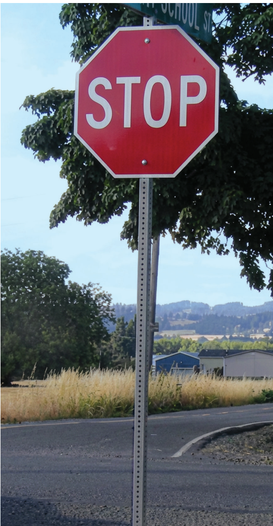
Standard Steel Post

BRIGHT RETRO-REFLECTIVE POST COVER IMPROVES DAY & NIGHT VISIBILITY...QUICKLY & INEXPENSIVELY