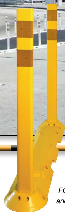
FG 300 Curb and EFX Post