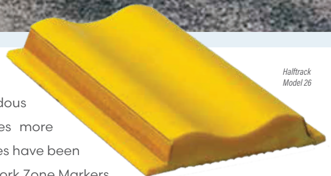
Halftrack Model 26

Higher visibility at longer distances means more preview time for drivers to see, think and react as they drive through hazardous work zones. The brightness of pavement markings becomes more critical as drivers age. Work zones are much safer when the lanes have been clearly delineated with Davidson RPM and Halftrack Durable Work Zone Markers.