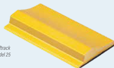
Halftrack Model 25