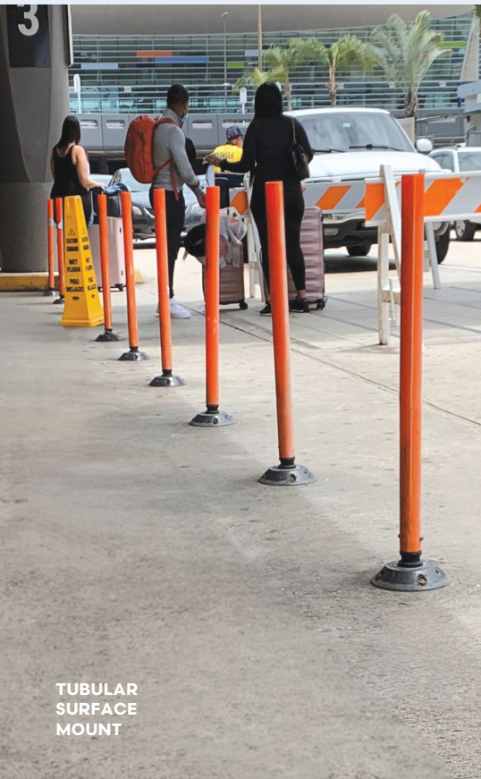
TUBULAR SURFACE MOUNT

FLAT TOP STAR, TUBULAR SURFACE MOUNT AND FLAT TOP GROUND MOUNT DELINEATORS